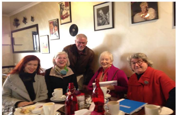
Wagga Wagga Team - presenters and readers who provide weekday readings to listeners in Wagga Wagga and Junee